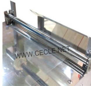
Film Position System