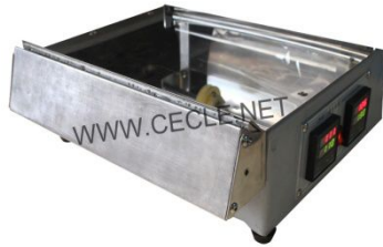
Heating and Cutting Device