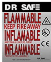
Highly visible warning label "Flammable-Keep Fire Away".

2"(50mm) leak-proof sump to contain spills.