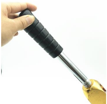
Step 4: screw handle to the body.