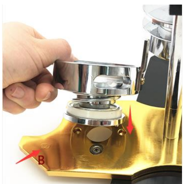
Step 2: put right mold on the B plate. Make sure the baffle align to the column.