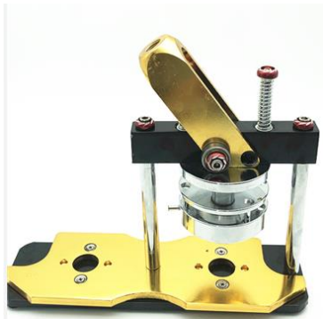
Step 1: set into upper mold. Align the bump with the groove.