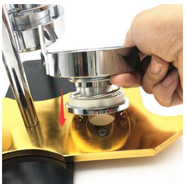
Step 3: put left mold on the other plate. Make sure the two baffles align to the column.