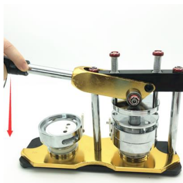
Step 3: press down the handle. Make sure there will be some gap in the top die when you press the left mold.