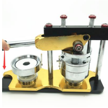
Step 4: rotating the machine, press down the handle. There must be no gap in the top die when press the right mold.