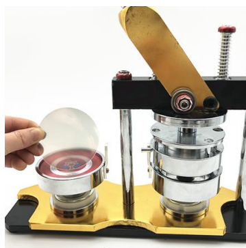
Step 2: place plastic film on circular printing paper. Then rotating the machine, place plastic pin badge on right mold.