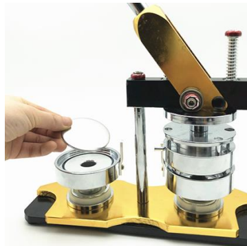
Step 1: place metal tin shell in left mold. Then place circular printing paper on metal tin shell.